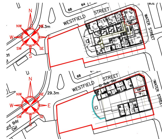
LOCATION PLAN (SCALE 1:1250)